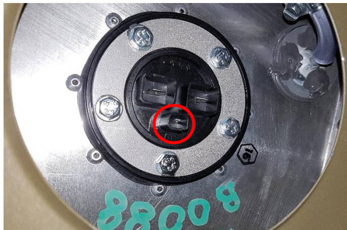
Fig. 2: Fuel probe attachment