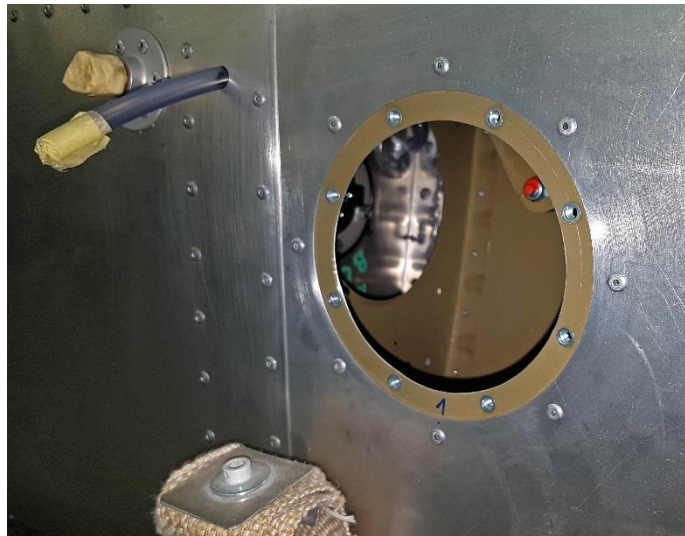
Fig. 1: Inspection hole for the fuel probe.